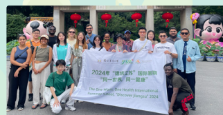
Visit Yuantouzhu Scenic Area in Wuxi City