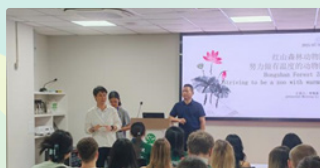
Visit Local Zoo