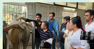
Visit Equine Center