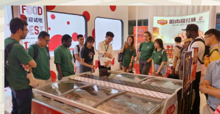
Visit Food Enterprise